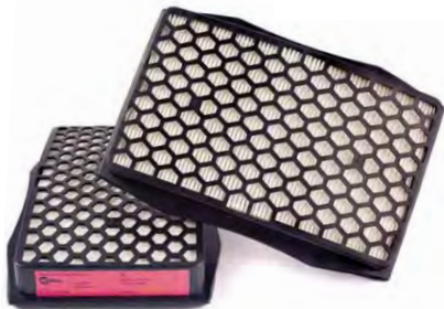
OTOS Particulate Filter (HE)

With the OTOS™ AIR WING III PAPR Kit, at risk workers exposed to hazardous particulates in the air have less to worry about.