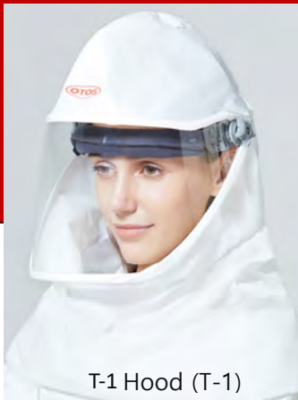
T-1 Hood (T-1)

AW-100-AH, T-1 Hood-1 (T-1) AW-100-AH, T-2 Hood-2 (T-2) AW-100-AH, T-3 Headcover-3 (T-3)