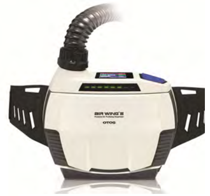
OTOS AIR WING III *OMC-R3